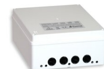
Art.740 CONTROL-LAMP-8 (8 lamps controller) Size: 24,5x19,7x9,5cm. - Weight: 1.25kg.