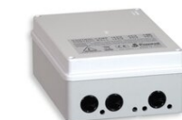
Art.739 CONTROL-LAMP-4 (4 lamps controller) Size: 20x15x8cm. - Weight: 0.7kg.