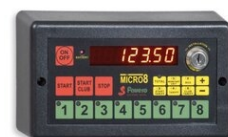
Art.708 MICRO8 Size: 21,3x12,3x5,6cm. - Weight: 0.75kg.