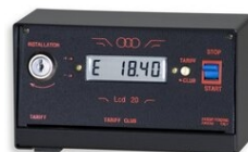
Art.121 ...LCD20/L with lamp control Size: 18,6x10,6x7,2cm. - Weight: 1.07kg.