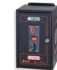
Art.200 COIN TIMER Size: 21,5x35,5x21,5cm. - Weight: 6kg.