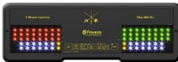
Art.825 FULL-ARM-01/W 3-weapon apparatus. Wall version Power supply not included . We suggest the art.954 or 828 + 169 Size: 56x19x4cm. - Weight: 1.1kg.