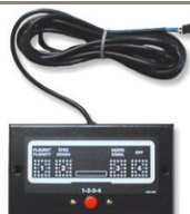
Art.837 Wired Remote Control for FA-01/W by 3.5m long cable Size: 15,5x9x1,6cm. - Weight: 0.5kg.

Useful to control the Full-Arm-01/W (wall version) when it is fixed too high on the wall.