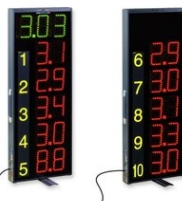
Art.143 KPB-10 Kit Performance Board for 10 judges