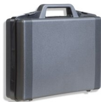
Art.140-12 Carrying case for 12 IR-REMOTE SCORER Spare part Size: 33x26x8cm. - Weight: 0.4kg.