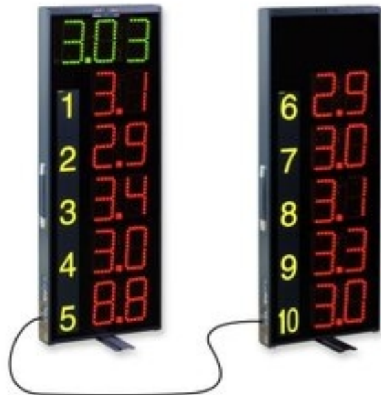
Art.140 KPB-5 Kit Performance Board for 5 judges Size: 38x101x7cm. - Weight: 11kg.