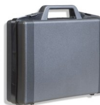
Art.140-10 Carrying case for 7 IR-REMOTE SCORER Spare part Size: 33x26x8cm. - Weight: 0.4kg.