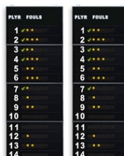
Art.262A FS-414A statistics panels, 2x14 players ( Fouls )

Size: 2x 120x320x11,5cm. - Weight: 165kg.