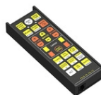
Art.938-12 Infrared remote control for FA-15 Spare part Size: 16x6x5cm. - Weight: 0.3kg.