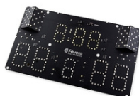
Art.0435-4350 SL SCH F1805 + F1806 LED board+buzzer for FA-15

Spare part Size: 13.1x6.1x3cm. - Weight: 0.05kg.