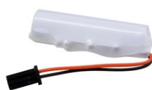
Art.952-4 Lithium-ion battery for TELE-IR FA-07/15 Spare part Size: 5x1,5x1,5cm. - Weight: 0.022kg.