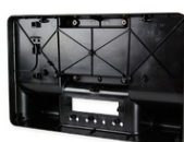
Art.0177-2620 FA-15 black plastic back case Spare part Size: 35x21x8cm. - Weight: 0.3kg.