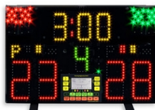
Art.940-01 FA-07-Scoreboard, without accessories

Spare part. It is included in art.940. Size: 60x40x13,5cm. - Weight: 2.8kg.