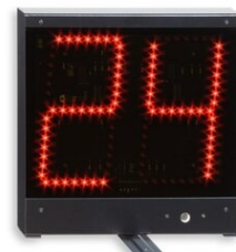
Art.273 DISPLAY 24-30s - supplementary display for KIT24-30s Size: 29,2x30,4x4,4cm. - Weight: 2kg.