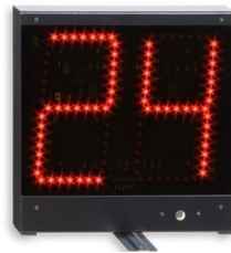
Art.273 DISPLAY 24-30s - supplementary display for KIT24-30s Size: 29,2x30,4x4,4cm. - Weight: 2kg.