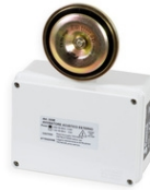
Art.333-PSX HORN 110db-2m for PS-X with 15m long cable Size: 16x22x8cm. - Weight: 2.4kg.