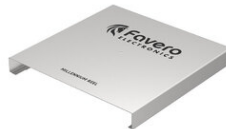
Art.900-06 ...Reel case cover (of stainless steel) Spare part Size: 34x34x4cm. - Weight: 1.7kg.