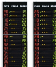
Art.262C FS-414C statistics panels, 2x14 players (Player No. +Fouls +Points) Size: 2x 120x320x11,5cm. - Weight: 172kg.

Size: 2x 120x320x11,5cm. - Weight: 168kg.