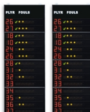
Art.262B FS-414B statistics panels, 2x14 Players (Player No. + Fouls)

Size: 2x 120x320x11,5cm. - Weight: 168kg.