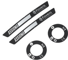
Art.772-94 EUR 20.41 Set of adhesive labels for Assioma UNO/DUO