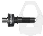
Art.772-65-S EUR 286.80 Right Assioma-Shi sensor with adapter