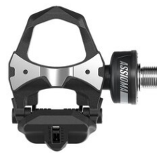
Art.772-50 EUR 335.98 Left pedal with sensor for Assioma UNO/DUO