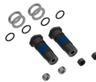
Art.772-73 EUR 49.10 Replacement set for Assioma DUO-Shi - adapters, bearings, hex nuts, etc.