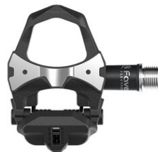
Art.772-58 EUR 81.89 Left pedal without sensor for Assioma Weight: 0.12kg.