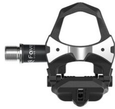
Art.772-59 EUR 81.89 Right pedal without sensor for Assioma Weight: 0,12kg.