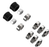
Art.771-72 EUR 32.70 Set of bearings, hex nuts M6, oil seal, end-cap for bePRO Weight: 0.02kg.