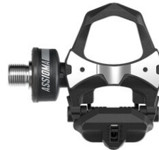
Art.772-51 EUR 335.98 Right pedal with sensor for Assioma DUO