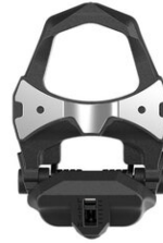
Art.772-60 EUR 49.10 Left pedal body for Assioma

Buying on this website is reserved solely for Resellers. If you are not a Reseller, you can buy Assioma on the cycling.favero.com website. Prices shown in this site do not include VAT or export costs.