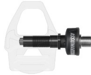
Art.772-64-S EUR 286.80 Left Assioma-Shi sensor with adapter