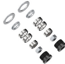
Art.772-72 EUR 32.70 Replacement set for Assioma - bearings, hex nuts, end cap, etc. Weight: 0.02kg.