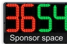
1-side, Only Front