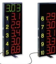
Art.143 KPB-10 Kit Performance Board for 10 judges