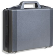
Art.140-12 Carrying case for 12 IR-REMOTE SCORER Spare part Size: 33x26x8cm. - Weight: 0.4kg.