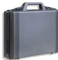
Art.140-12 Carrying case for 12 IR-REMOTE SCORER Spare part Size: 33x26x8cm. - Weight: 0.4kg.