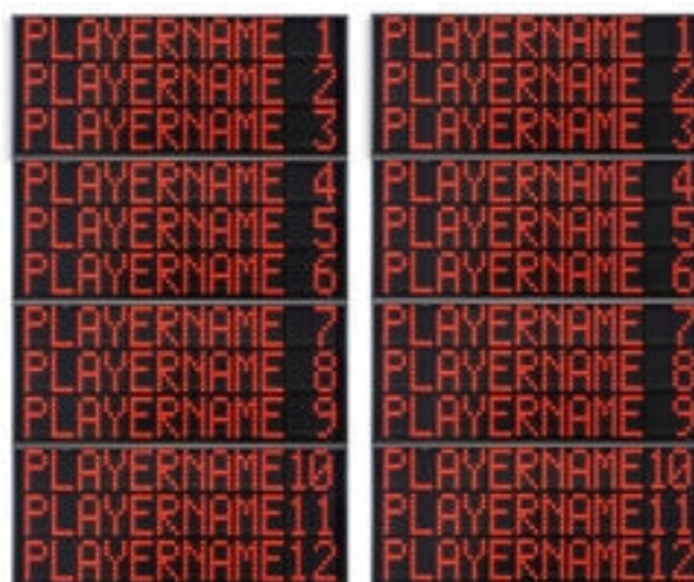
Item codes and prices (not including VAT)