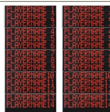
Art.262F ...FS-414F Panels of players' names, 2x14 players Size: 2x 145x300x11,5cm. - Weight: 206kg.