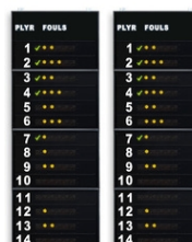
Art.262A FS-414A statistics panels, 2x14 players (Fouls) Size: 2x 120x320x11,5cm. - Weight: 165kg.