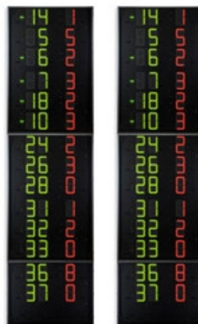
Item codes and prices (not including VAT)