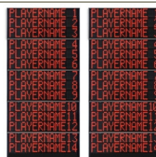
Art.262F ...FS-414F Panels of players' names, 2x14 players Size: 2x 145x300x11,5cm. - Weight: 206kg.