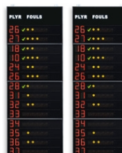
Art.262B EUR 6 045.00 FS-414B statistics panels, 2x14 Players (Player No. + Fouls)

Size: 2x 120x320x11,5cm. - Weight: 168kg.