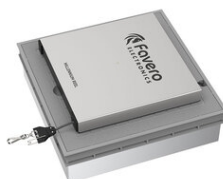
Art.904 ...WASSERGRUBE für Kabelrolle Millennium Abmessungen: 45x45x12,5cm. - Gewicht: 5.3kg.