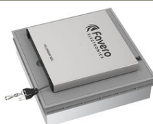
Art.904 ...WASSERGRUBE für Kabelrolle Millennium Abmessungen: 45x45x12,5cm. - Gewicht: 5.3kg.