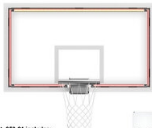
Art. 253-21 includes: