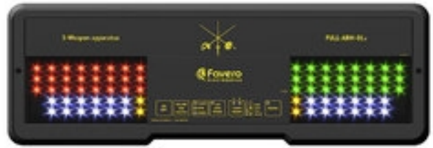
Art.825 FULL-ARM-01/W 3-weapon apparatus. Wall version Power supply not included . We suggest the art.954 or 828 + 169 Size: 56x19x4cm. - Weight: 1.1kg.