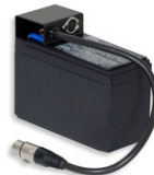
Art.828 RECHARGEABLE BATTERY 12V/7Ah with connectors Size: 15.5x12.5x9cm. - Weight: 2.7kg.