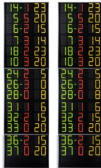
Item codes and prices (not including VAT)